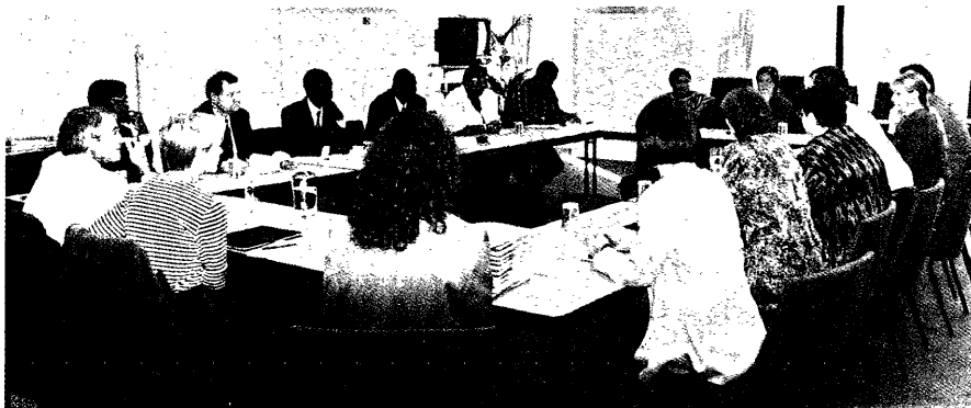
Members of the Committee meeting ABA members and staff.