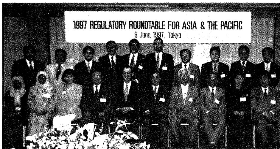
Top: Participants in the 1997 Regulatory Round Table for Asia and the Pacific

The 1998 meeting of the Regulatory Roundtable will be held in Korea.