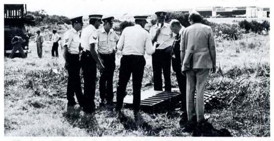
Members of the Australian Federal Police, NSW Police and Department of Transport officials inspect a piece of 'wreckage' where one of the two 'lost' radio-active packages was found. Protective Service and General Duties members worked side by side during the annual mock plane crash exercise conducted at Sydney Airport.

More than 800 people from the Department of Transport, Airport