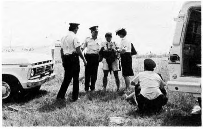
Federal Police assist an injured passenger to collect her belongings before being transferred to the international Terminal at Sydney Airport for Medical attention.

Passengers and wreckage were strewn over a wide area of rugged, bush-like ground which made rescue attempts more challenging.