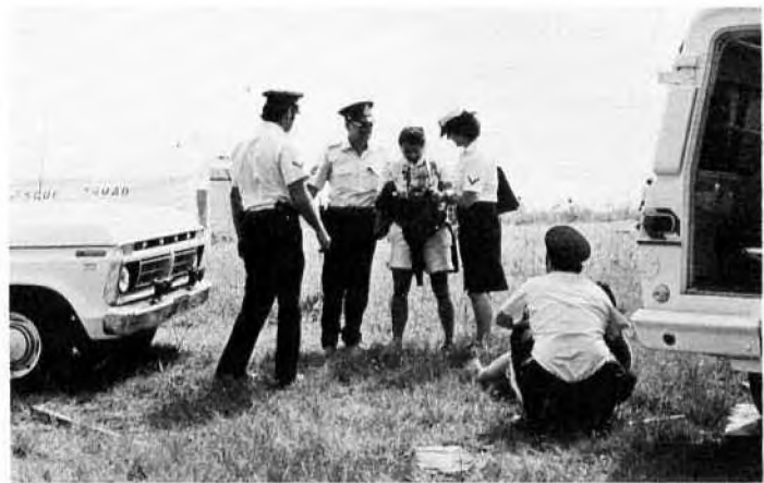
Federal Police assist an injured passenger to collect her belongings before being transferred to the international Terminal at Sydney Airport for Medical attention.

ion Services personnel stationed at Sydney Airport and Divisional Headquarters.