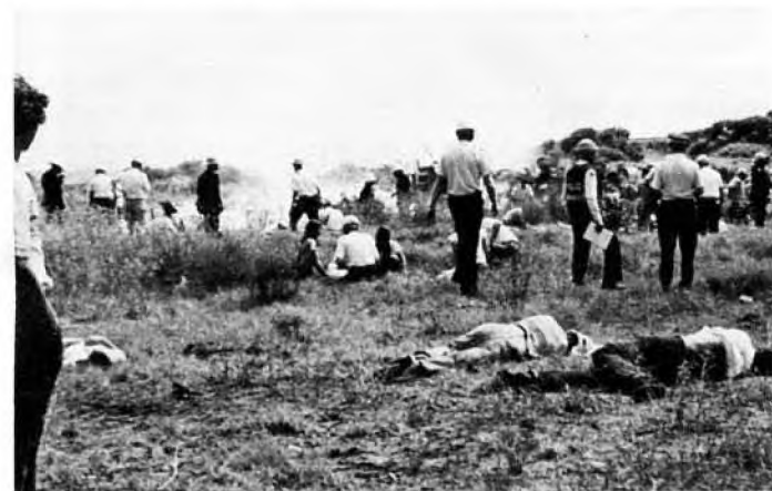
'Victims' of the air 'crash' are scattered over a wide area. The mock plane crash exercise is conducted to prepare emergency services for real life air crash tragedies.