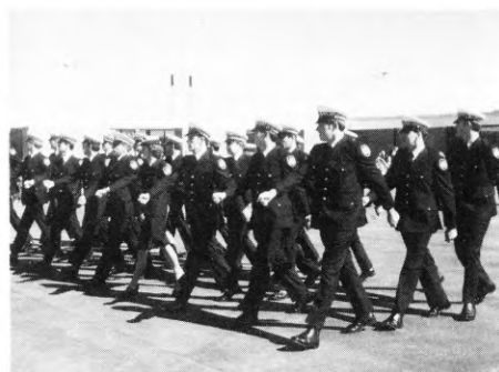
Members of the General Policing Course march past the official dais.

Extensive landscaping with careful selection of evergreen deciduous trees and native shrubs has been made with a view to blending the area with the pine forest on one side and the residential area on the other.