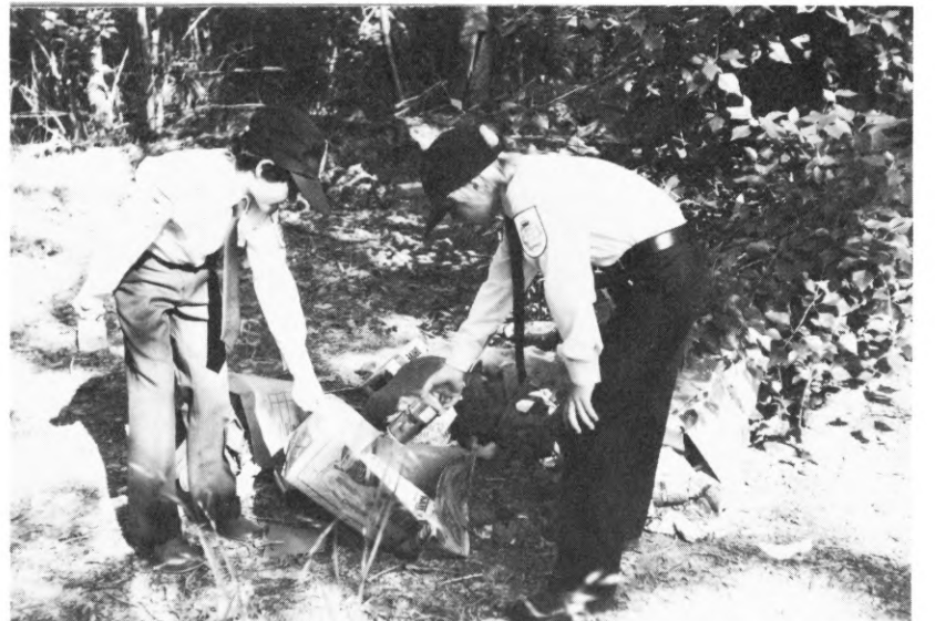
Bushcraft training for the young Rangers helps instil an appreciation of landholders' property and the problems of erosion and pollution.