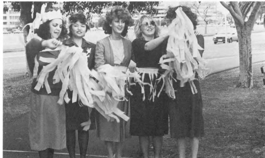
• A cheer squad for the 10kms race. The girls are attached to 'Operation Edam'.

An indoor-cricket match is planned for the near future.