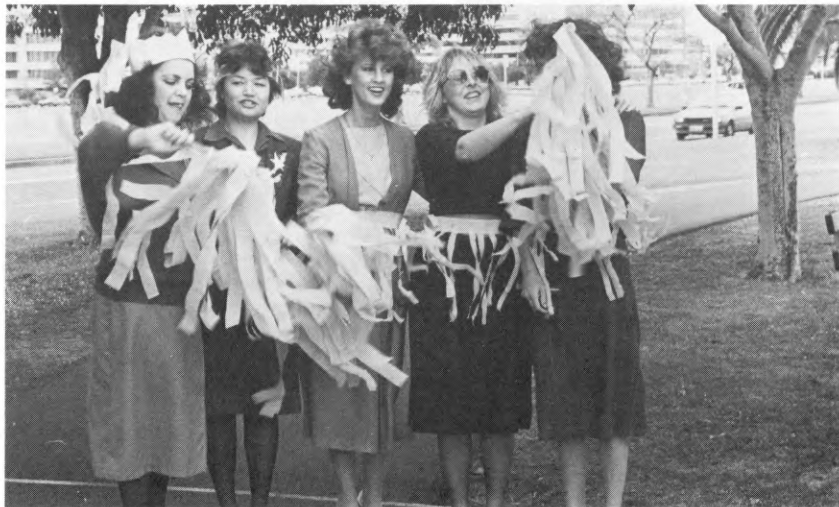
• A cheer squad for the 10kms race. The girls are attached to 'Operation Edam'.

An indoor-cricket match is planned for the near future.