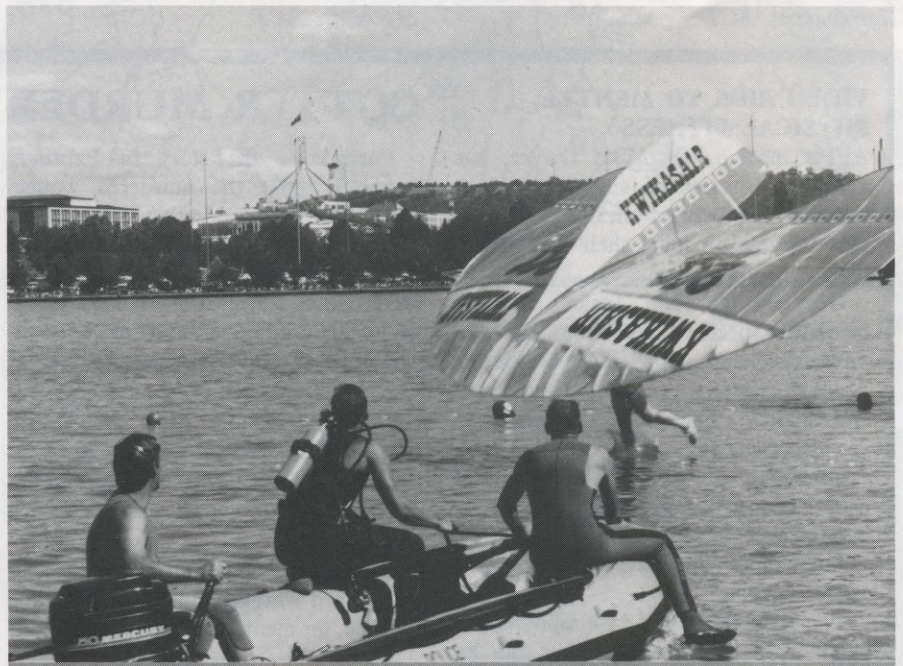
At the Birdman Rally the ACT Diving Squad provided instant recovery services for the competitors.