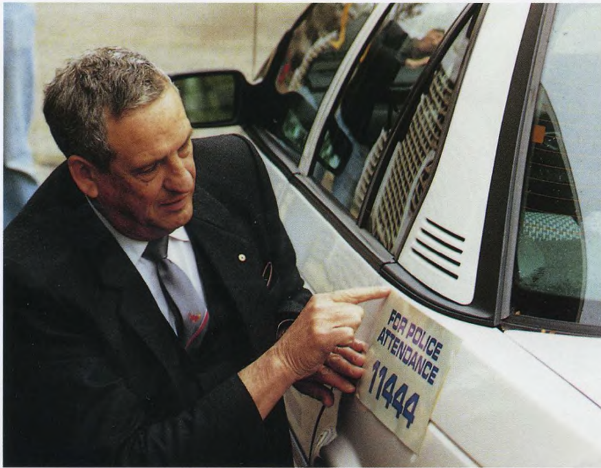
During Crime Prevention Week the 'Police Attendance Line' (PAL) was launched by Commissioner McAulay as an ongoing service. ACT residents in need of immediate police attendance can dial ACT Operations direct on 11 444 .