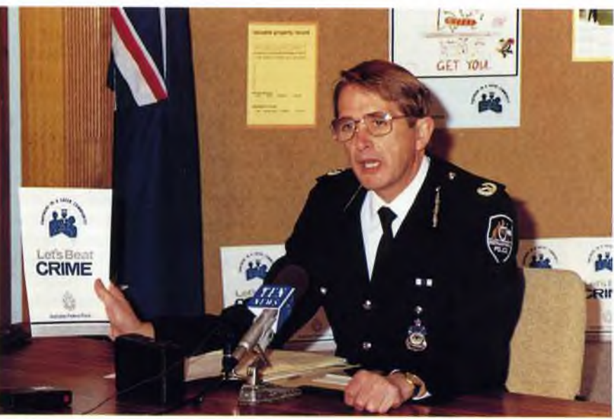
Assistant Commissioner Brian Bates launching the AFP produced booklet "Let's Beat Crime".