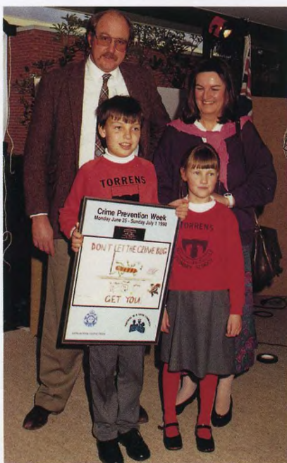
Platypus 30, April - June Quarter, 1990