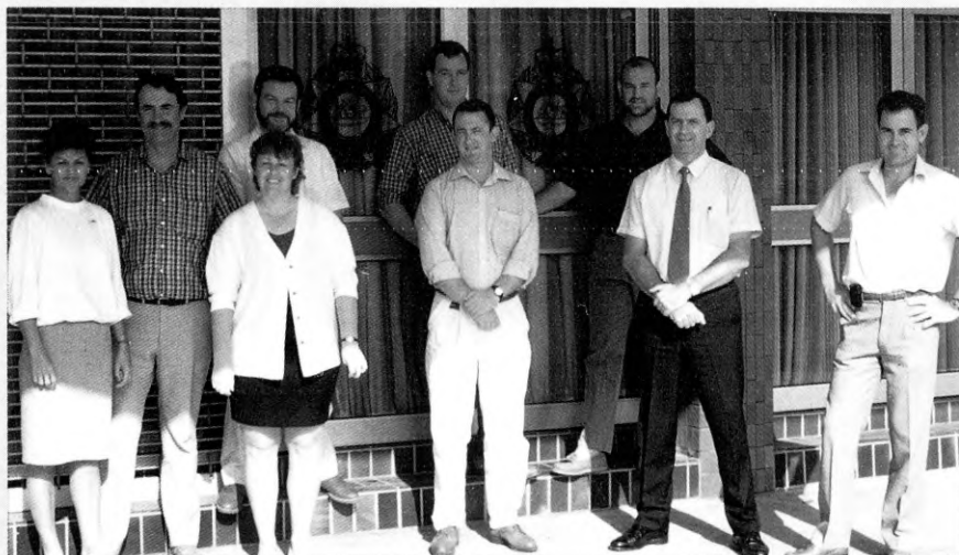
Some of the members and staff of the Cairns office

"While it is generally an attractive area, particularly in the dry season, the wet season from November to