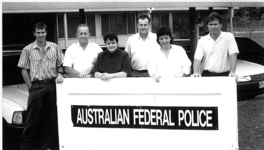
Some of the members and staff of the Townsville office

"Gone are the days when Cairns used to have two international flights per week from PNG. There is no curfew on flights and the peak ar-