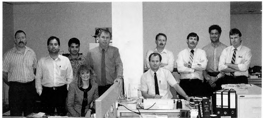
Some members and staff of the Gold Coast Branch

"For the Federal Police, the State Police and the CJC to have mounted such a long and detailed campaign is remarkable. The organisation behind it must have been excellent. All involved in the investigation and presentation of this matter should be commended by the Court and I do so now."