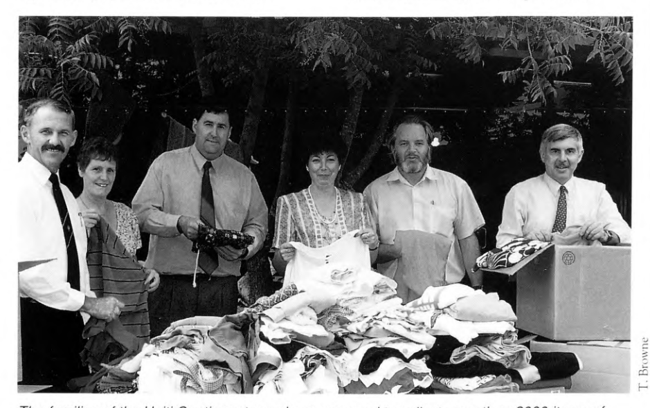
The families of the Haiti Contingent members managed to collect more than 2000 items of clothing which were forwarded to Haiti. Pre-dispatch sorting was done at the GPPAD offices at the Weston complex.

Regardless of the quality of the catering, and the other day-to-day difficulties, most contingent members said that they returned to Australia better officers for the experience.