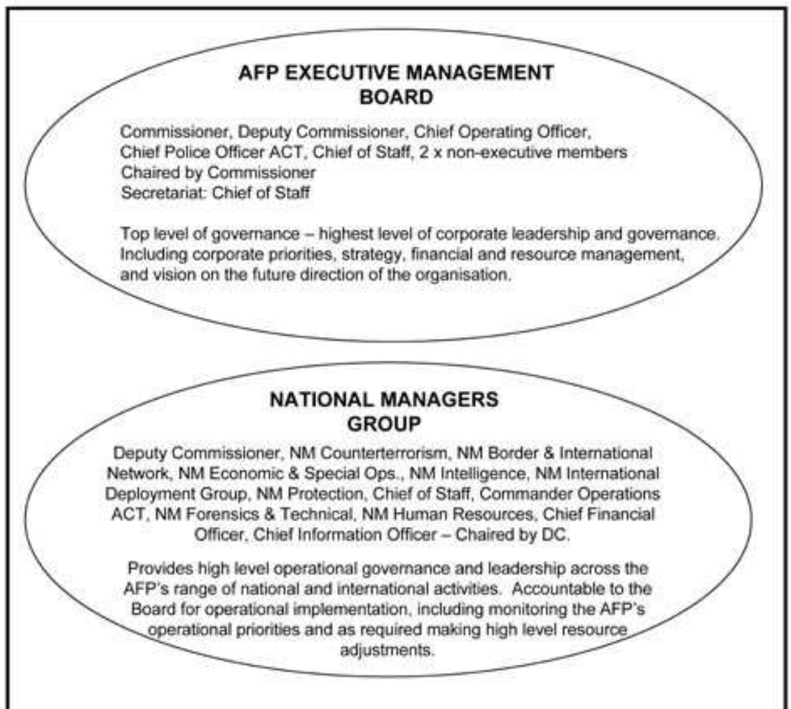
Diagram 3 – AFP Governance Framework of high level management committees