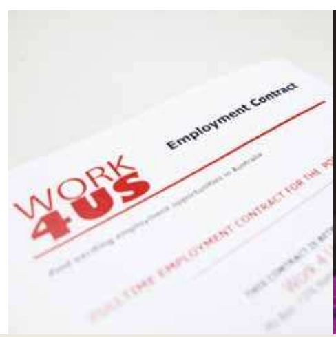
04: The AFP Human Trafficking Teams have unearthed some horrendous sexual slavery and labour exploitation crimes in Australia.