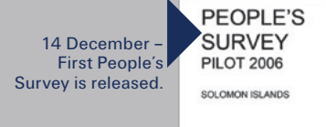
14 December – First People's Survey is released.