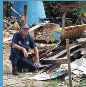
2 April – The 2007 tsunami impacts Solomon Islands, RAMSI provides assistance.