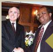
April – Solomon Islands' Prime Minister Sir Allen Kemakeza makes an urgent request for assistance to Australia. Prime Ministers Howard and Kemakeza meet on 5 June 2003.