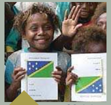
23 July – Community days mark 5th anniversary of RAMSI.