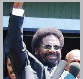
26 April – Snyder Rini stands down as Solomon Islands Prime Minister.