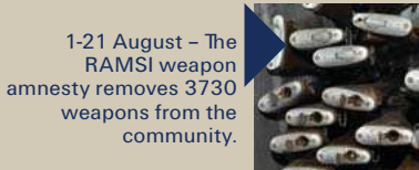
1-21 August – The RAMSI weapon amnesty removes 3730 weapons from the community.