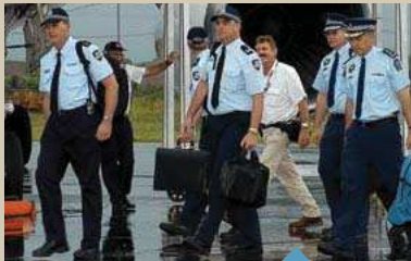
24 July – RAMSI deploys.