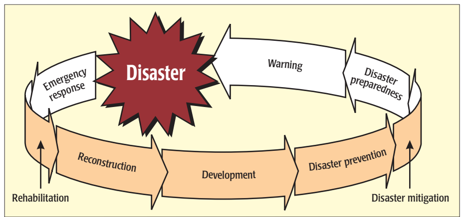
Figure 1: Circular model of disaster

One approach to disaster process modeling which takes these points into account is to use a two-dimensional Cartesian plane. On this 'phase plane,' the 'x' and 'y'