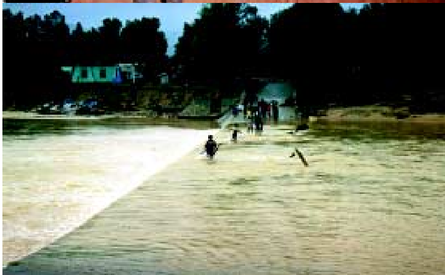
Above: Many aspects of nature are uncontrollable by humankind. Above: the 2001 Indian Earthquake, and the 2000 floods in Vietnam.

advantage of available safe sites, but subsequent growth typically spills over into adjacent high-risk areas. Coastal metropolises of Australia and the United States and