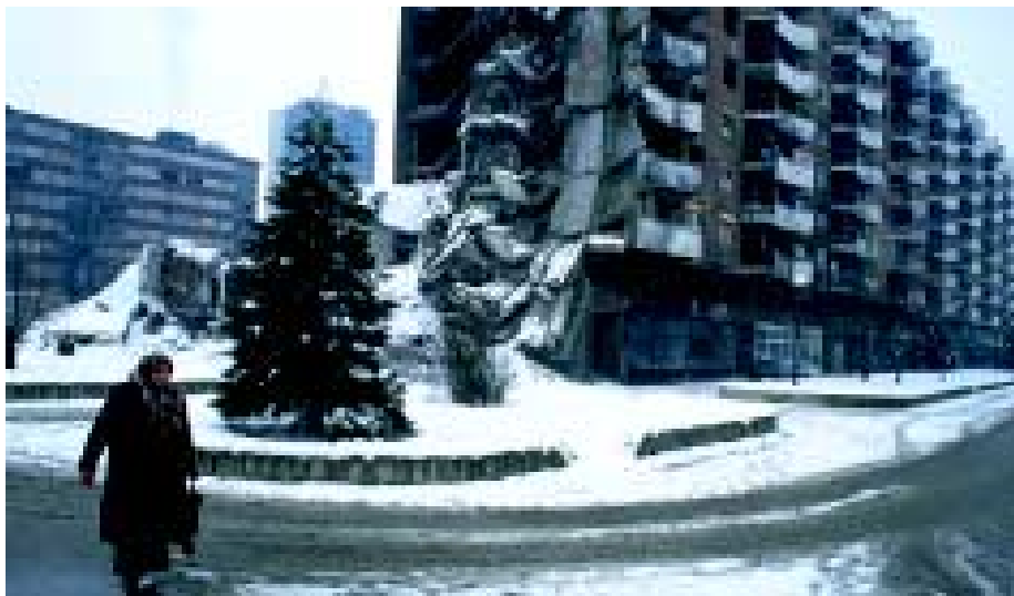
Above: Wars have frequently been associated with large-scale destruction of urban areas.

Urban development increases disaster-susceptibility in a number of ways. First is the frequent association of cities with naturally risky locations such as seacoasts and floodplains because such places also confer important benefits (e.g. buildable land, well-appointed sites for the collection and transshipment of goods, and fertile hinterlands). Initial settlements may take