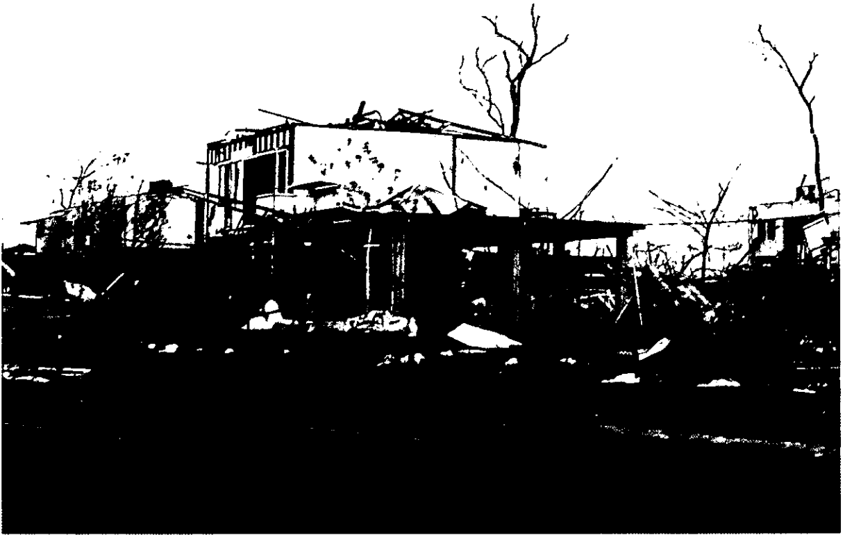
Type of impact varies enormously so survey questions must also suit various places and events.

that the river had never risen so high before, or the floodwaters had never been so extensive. This is usually quite true, for any individual, but the devastating natural hazard is a predictable process at the State level. People who experienced severe loss of property, experienced that loss precisely because they never expected it (Goudie & King 1997).