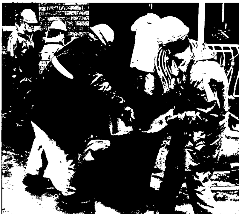
Examining the impact of a disaster immediately after the event has been a role for the Centre for Disaster Studies since it was first established in the 1970s.