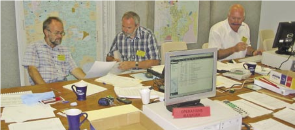
Control centre in Exercise Noonamah

While the concept of the RRT had been discussed for many years, turning this concept into reality was easier said than done. The tasks faced by the co-ordinators were many and varied and included: