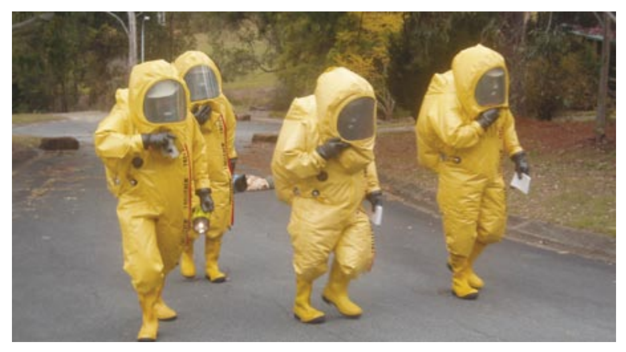
Four-person crime scene team in Level A protection.