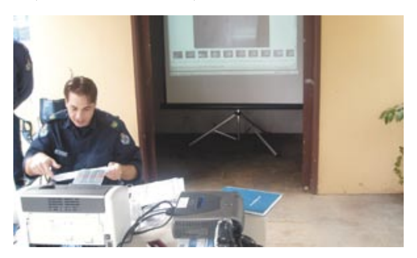
Imagery of crime scene is downloaded and available for subsequent briefings of relief crime scene teams.