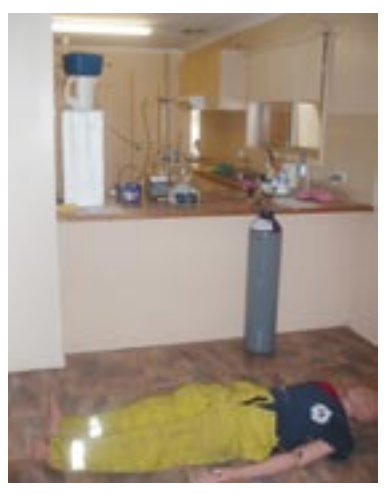
Terrorist Sarin lab and 'dead' terrorist.

Exercise Orchid Alert provided an opportunity to practice a number of operational CBR forensics procedures and allowed participation of forensics teams from three States. The lessons learned will help improve preparedness to respond to CBR incidents.