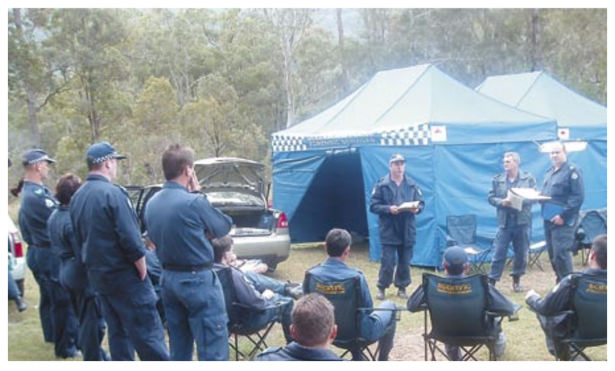
Forensics personnel receive initial briefing.

All forensics team members were initially briefed on the situation at a briefing area adjacent to the crime scene, with the forensics entry team being given a more detailed brief at a command site prior to dressing and entering the buildings. Radio communication was maintained between the team leader and the command site and team members were equipped with still and video cameras.