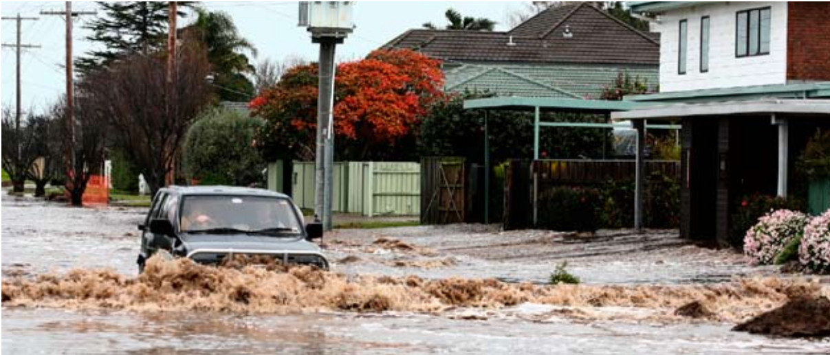
Floods constitute approximately one-third of all naturally occurring disaster events.

experience. Participants from roles such as local and state planning agencies, state emergency services, bushfire planning and response, and floodway management agencies, are invited to apply throughout Australia.