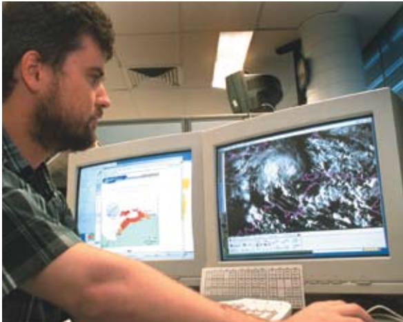
Using electronic means to assess the impact of disasters.

the most densely settled areas. For example, the South East corner of Australia is the most fire-prone area in the World. Fire behaviour ranges from widespread grassfire to intense, hot-burning wildfire. While accurate worldwide estimates of bushfire impacts have not been documented, income and production loss in the Shires of Alpine, East Gippsland, Indigo and Towong from January to May 2003 – following the widespread Alpine fires that summer – is estimated to be $121.1 million (Gangemi, Martin, Marton, Phillips, & Stewart, 2003). In addition to the above, earthquake, severe storm, and landslip are also important hazard sources.