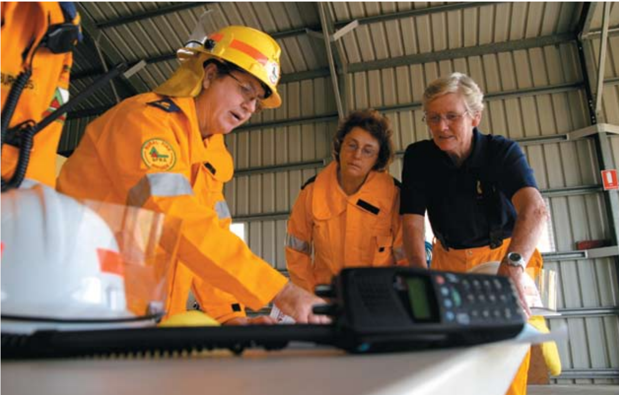
Queensland Rural Fire Service volunteers getting ready for the next fire season.