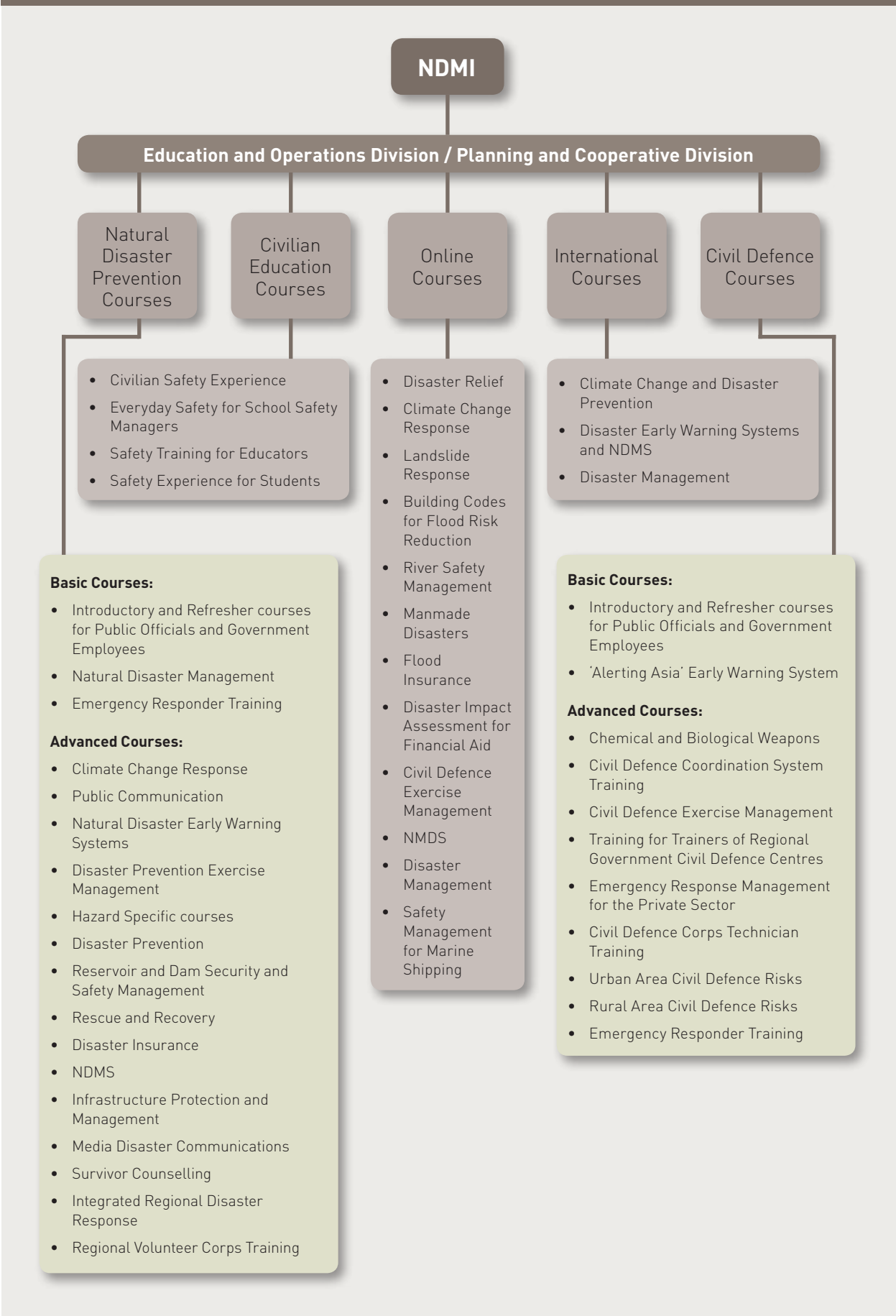
Figure 2. A selection of the courses offered by NDMI.