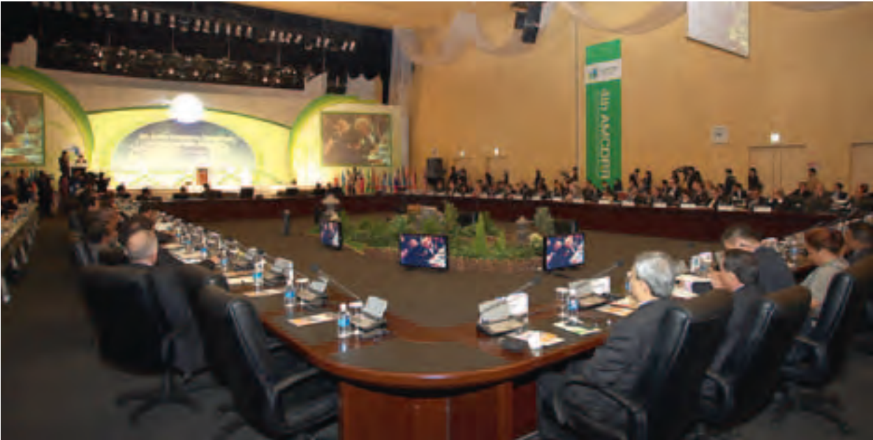
The AMCDRR, Incheon, October 2010.

Institute (NDMI), a department of NEMA, has begun hosting international education and training activities for government and non-government agencies from Asia and the Pacific region.