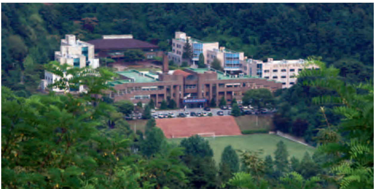
The NDMI and National Fire Service Academy campus.

The training is mandatory for local government officials who are responsible for operating the System in their district. The overall aim is that officials come away equipped with the knowledge of how to report disaster information correctly to NEMA's Control Centre using the System's procedures in the event of a hazard occurring. NDMS training is a component of several of the NDMI courses and approximately 1000 government officials have been trained to date (NDMI, 2011). The RoK's NDMS is considered successful and has been exported for use in several countries including Indonesia and Paraguay.