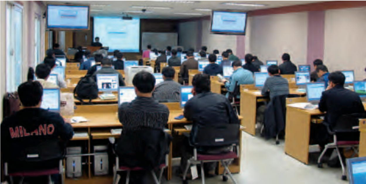
A classroom in the NDMS Information Centre.

The NDMS building also houses eight discussion rooms designed specifically for group work exercises, which form an essential component of all of the courses that NDMI runs. As with the teaching rooms in the main building, each room is well equipped and appealing to those who want to learn, with a large whiteboard for brainstorming ideas, a computer terminal and a conference style table to facilitate group working and the preparation of presentations. This style of learning is encouraged by NDMI to allow trainees to demonstrate and consolidate what they have learned, and often an element of competition is introduced to the group work portion of the classes to encourage high standards.