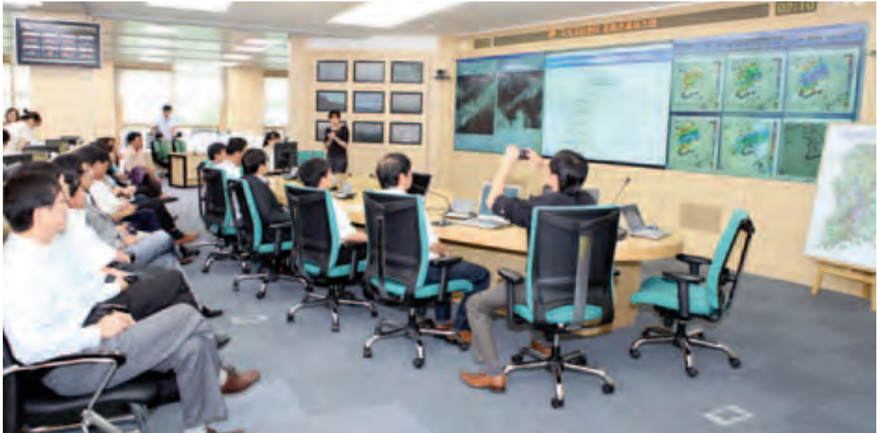
Visiting the Meteorological Office.

As may be expected, quality control is also viewed as very important. Course material and trainee feedback are assessed annually by the Education and Operations Division and the resident professors so that courses can be assessed for quality and revised where necessary.