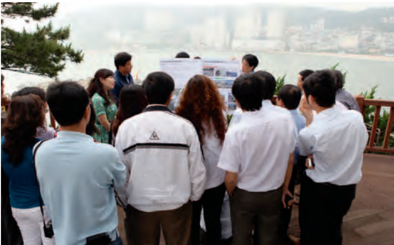
The Vietnamese delegation on a field trip.

The variety of courses the Institute offers is impressive. Courses are tailored to the seniority and existing knowledge levels of those attending, so that all are catered for according to their needs. The staff-members of the Institute are committed to providing a high standard of educational experience for those that visit and were openly enthusiastic in describing the work which the Institute is doing.