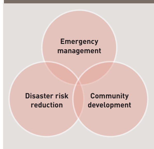
Figure 1. Interrelationship of the three fields required to build community disaster resilience.

A relationship between the three disaster resilience-building fields is shown using the simple Venn diagram in Figure 1. Depending on the resilience 'profile' of a community, the importance of each field can be larger and smaller, and their linkages more critical (and thus not necessarily equal as shown in Figure 1).