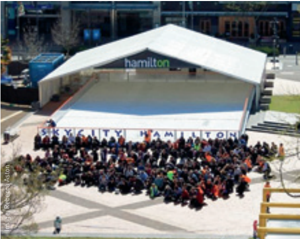
Hamilton City Council participate in a New Zealand ShakeOut flash mob in Garden Place, Hamilton.