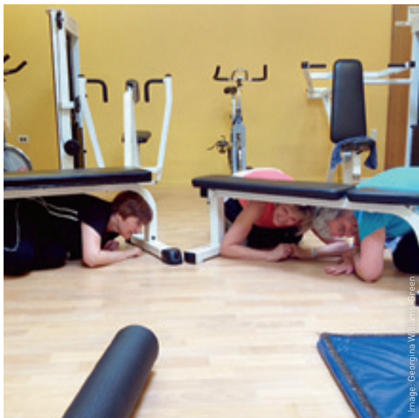
Recreation Centre staff and members drop for cover during a workout session.