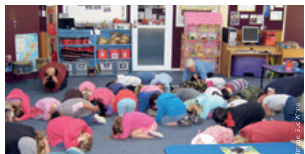
Staff at Waipawa Kindergarten taught the children the right actions to take during an earthquake.

In Hawke's Bay nearly 47,000 residents registered to participate in New Zealand ShakeOut , a great result! Schools, local authorities and other workplaces dropped, covered and held with some going on to complete full evacuation and rescue exercises. Solar powered torch radios and personal survival kits were given away as incentives to register for New Zealand ShakeOut with more available to anyone in Hawke's Bay who uploaded stories or photos of their ShakeOut experience. An important element was the use of the well-known Hawke's Bay Civil Defence Emergency Management Group website ( www.hbemergency.govt.nz ) to provide local content and links to the national New Zealand ShakeOut website.