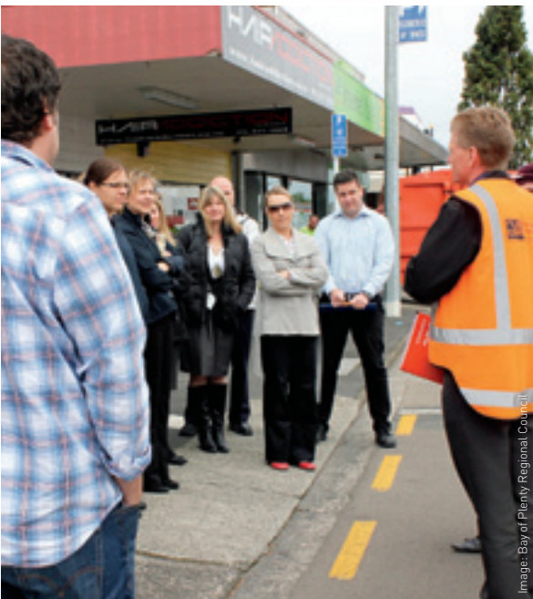
Bay of Plenty Regional Council staff in Tauanga assemble after an evacuation of their building during the exercise.

After the whistles had stopped being blown and Bay of Plenty Regional Council staff were given the all clear to emerge from under their desks, the real benefit of the exercise was obvious at the debrief. Staff began thinking about what they'd do once the shaking stopped, and how they might contact their families and meet up with them when they couldn't just jump in a car. The debriefs in each of the five offices provided food for thought for many staff who then headed home to ensure their household emergency plans were up to date.