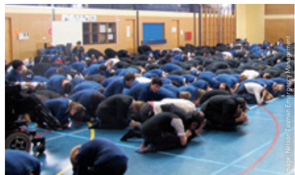
Students at Garin College, Nelson take part in the Drop, Cover and Hold drill.

Nelson City and Tasman District Councils had all staff, Mayors, Deputy Mayors and CEOs practising Drop, Cover and Hold. Staff and teachers of Garin College gathered in assembly and did the drill - just over 500 students at once! Local pre-schools had a 'shaky shaky' day, having jelly castles, and messy lunches. Nelson Mitre 10 Mega hardware store hosted local radio stations and the Nelson-based New Zealand Response Team 2. Nelson Library had a real turtle come in for Turtle safe story time (Turtle safe is the resource used to teach pre-school aged children Drop, Cover and Hold). The builders at all Gibbons sites stopped work at 9:26am and did the Drop, Cover and Hold drill.