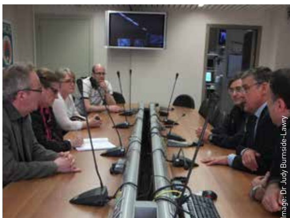
Consultation between emergency services personnel and community representatives on disaster risk reduction.

Examples of effective communication strategies have been piloted already, often in regard to bushfire preparedness, using participatory design-led research methods to facilitate co-creation and communication of local knowledge on risks and resources of their specific locality (Akama 2010, 2012). Through these processes residents share their perspectives and understandings of neighbours, neighbourhood environment and potential hazards, and question assumptions and generalisations. The process of visualising tacit or informal knowledge can make it tangible, concrete, valuable and significant for mitigation and planning. These design methods show the importance of social interactions and demonstrate potential of bridging relationships between neighbours that can lead to better preparation for all hazards. Key research questions to guide this research are; how can participatory methods of engagement be built