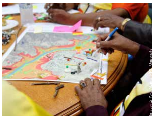
Community-based dialogue: Aboriginal elders and volunteers in Cherbourg, Queensland, share their knowledge by mapping local risks and resources and build preparedness for floods.

the way communication is framed for different community sectors and demographic groups. Among the key research issues for this theme to address is how communication capacity may both create vulnerability and reduce vulnerability before, during and after a disaster event in different ways. There is also a need for an improved understanding of how different 'communities' are composed—especially the content and form of 'communication capacity' in different locations. This last feature of future research is particularly important in balancing the hunger for technical information and measurements with community needs. Such information must be rendered both legible and relevant to the public if it is to be useful.