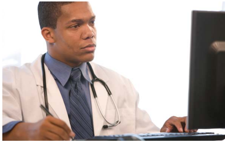
TANGLED WEB: Critics say accreditation process is too complex.

Dr Douglas says Australia's current policies on overseas trained doctors are actively dissuading foreign medical academics and teachers coming to Australia.