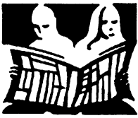
Table 8 Capital City and National Newspaper Ownership Shares