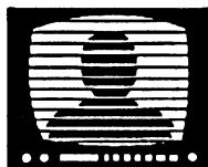
Table 2 Audience Reach (Television) Television Networks/Multiple Licensees