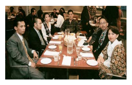
Welcome Dinner for Indonesians 2001

The first workshop was held for 15 Indonesian officials in April -July 2001. The second workshop is taking place from April to June 2002, for 19 Indonesian government officials. In addition to a number of external experts engaged specifically for the workshops many lecturers from within the Faculty have been involved in the delivery of the workshops and seminars.