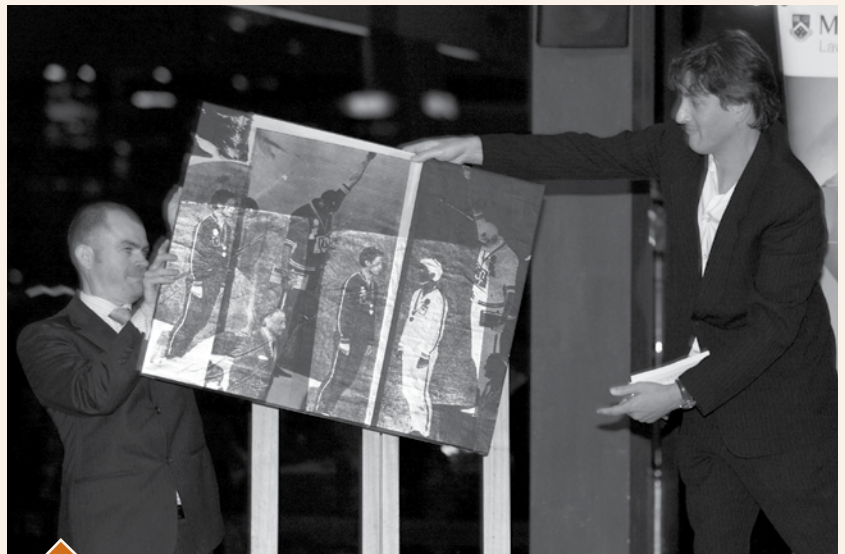
Charity Auction item "Study for "A Simple Act"" sold during an exciting auction