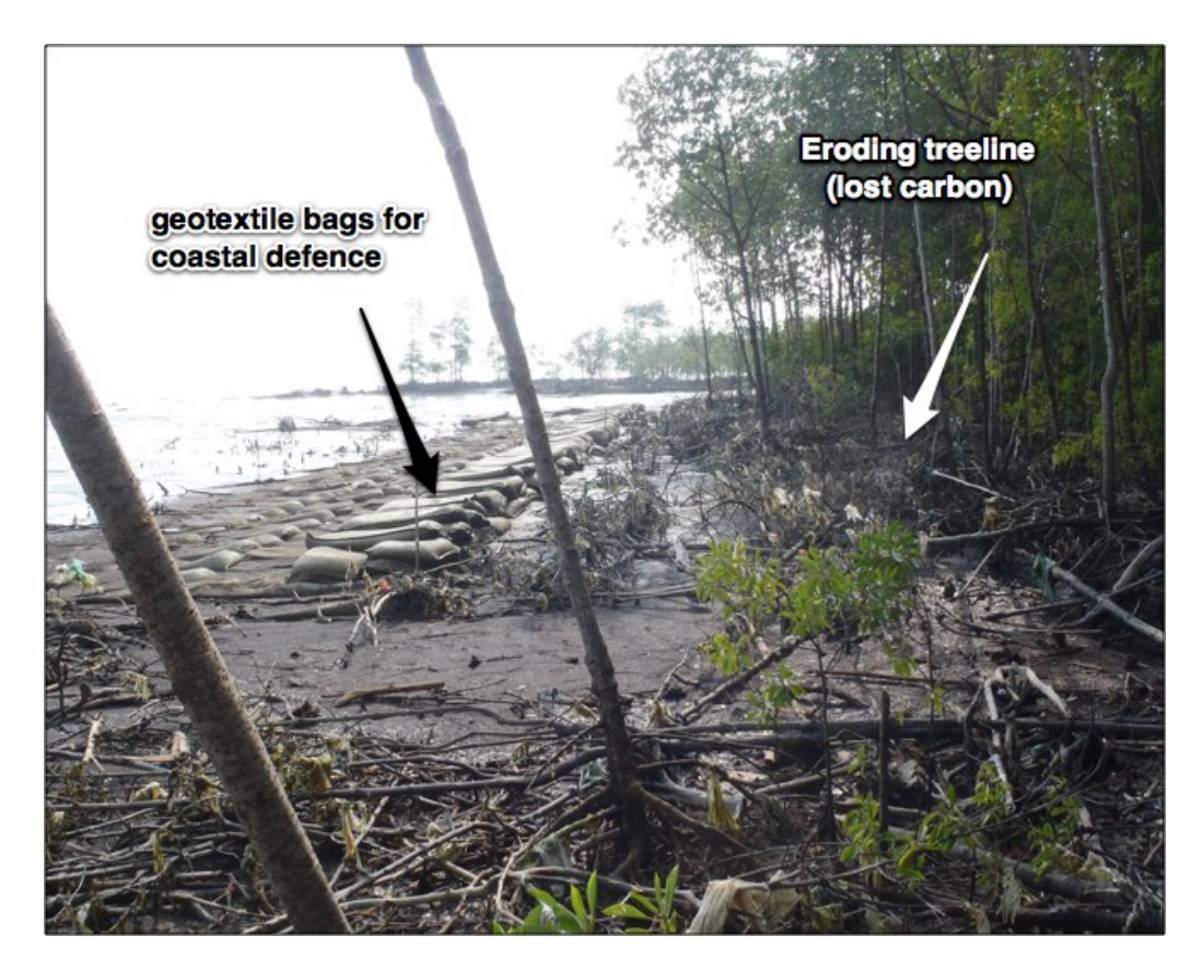
Figure 1: Severe erosion is experienced at Tanjung Piai National Park, despite extensive coastal protection measures (eg sandbags in the photo), due to the movement of large container ship and tanker traffic less than three kilometers offshore. (February 2011).

addresses a different physical issue and spatial/temporal scale compared to a policy aimed at reducing the spread of illegal peat forest fires.