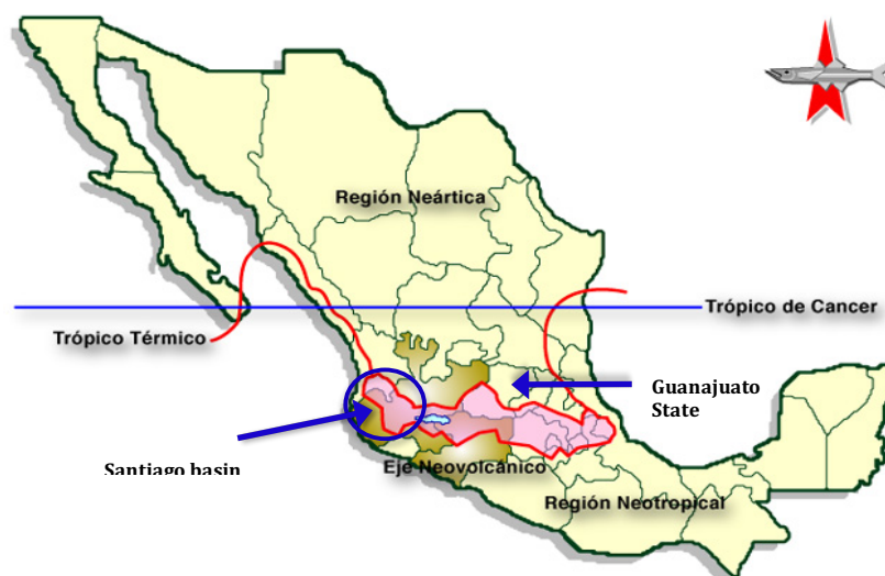
Map 1: Mexico, showing the study area: Santiago basin 16

Disputes over the allocation of water resources have now become a significant political and economic factor in the region. Water scarcity has become the major limiting factor of economic growth in the Santiago river basin as well as a risk factor for the stability of major local cities of the state, such as the capital, Guadalajara. 14 The state of Guanajuato, which borders the Santiago basin and is the home to an industrial cluster, also suffers from significant water limitations. Tagle states that the water deficit in Guanajuato has reached 128 million cubic metres. 15 To solve the water deficit problem, a decision was taken to construct a 140 kilometre aqueduct to carry 3.8 cubic metres per second of water from the Santiago River to the industrial districts and the development of urban areas in Guanajuato.