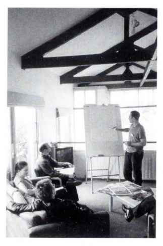
Planning ahead for 2001