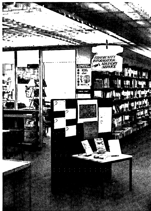
Parks Community Centre Library

The development program depends very heavily on the support of local authorities and the agreement of local institutes to dissolve. Although the program started well, local interest has skyrocketed over the last two years and the Libraries Board currently has a waiting list of 15 public libraries and 14 school-community libraries. As councils are seeing the benefits of a public library service in neighbouring municipalities they are asking for one too.