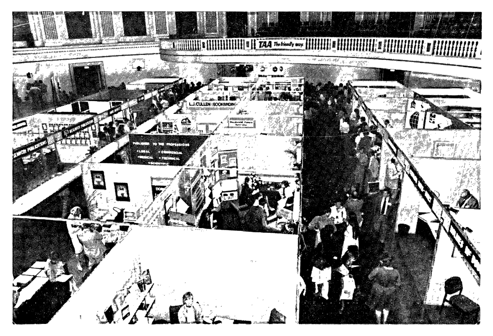
Another view of the Trade Exhibit in City Hall