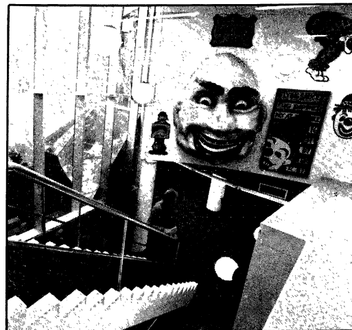
Items from the Luna Park Collection decorate the stairwell down to the new lower ground floor where, for the first time, a separate Young Adult Section has been set up.

Another feature of the new Stanton Library is a large exhibition space on the third level. Regular exhibitions are being planned including a