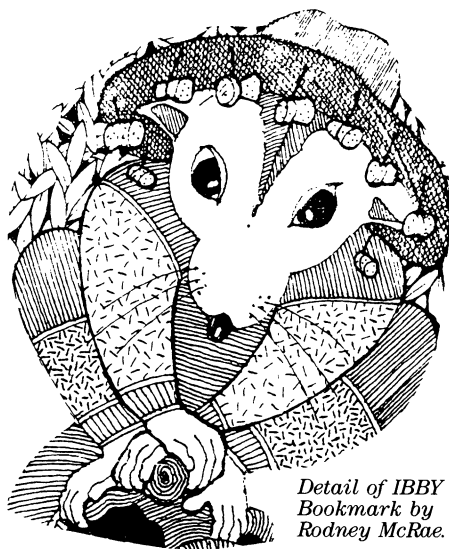
Detail of IBBY Bookmark by Rodney McRae.

Posters and messages are being distributed to the 50 member nations of IBBY and are