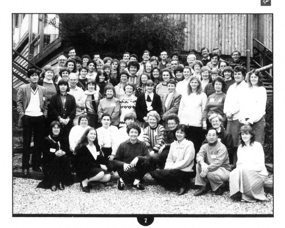
More than sixty delegates from forty-five CSIRO libraries converged on the alpine resort of Merrijig, Victoria, for the successful 1989 CSIRO Libraries Conference.

The next CSIRO Librarians' Conference is planned for early 1991.