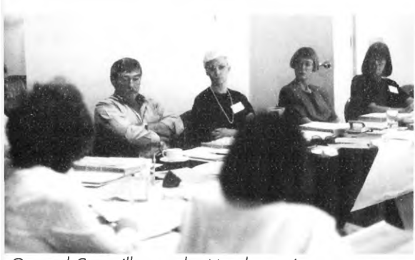
General Councillors at the March meeting

A summary of all of the issues discussed at General Council is found on page 22, a more complete summary available to ALIA members from the National Office.