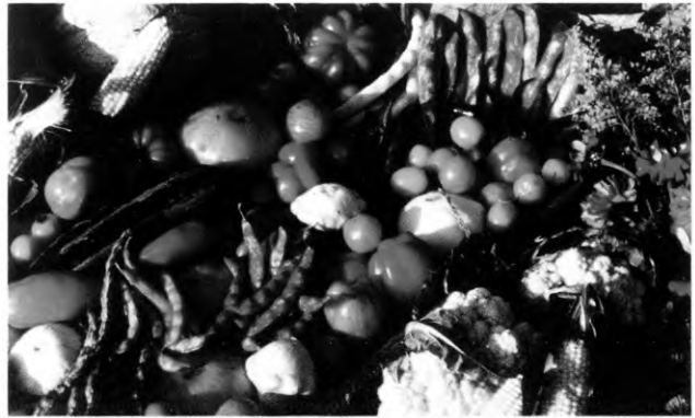
Summer vegetable harvest

Six thousand gardeners have been involved in the program since it started in 1986. The organisation is funded by members' subscriptions and sales of the Handbook , 18 000 of which have been sold since 1993 (four prints); more than four hundred libraries have copies. (ISBN 0-646-10226-5)