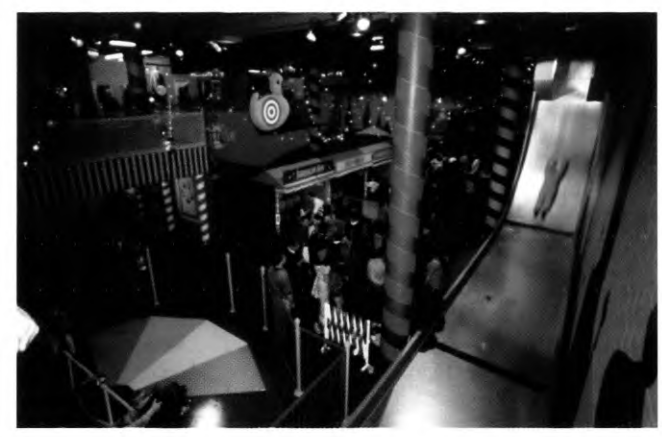
Sideshow gallery at Questacon

Stromlo Exploratory is an educational centre designed to help satisfy the never-ending quest for knowledge about astronomy and related sciences. Mt Stromlo Observatory has been a part of Canberra's heritage since 1924, is a fully op-