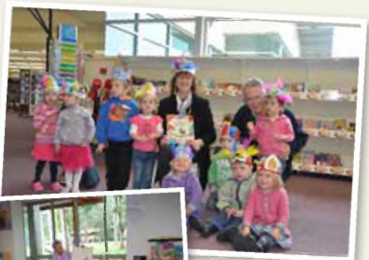
NSS at Mt Barker Public Library, SA