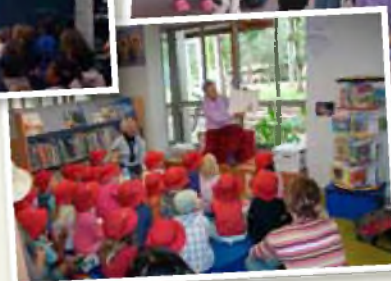
NSS at Bellingham Library