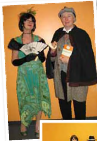
Phryne Fisher and Hercule Poirot consider the evidence