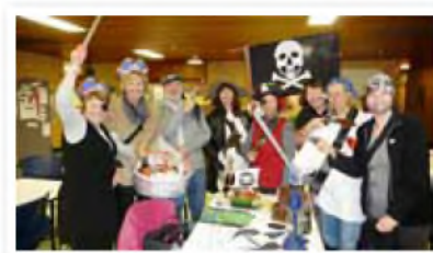
Winners of the Best Dressed Table Award celebrate