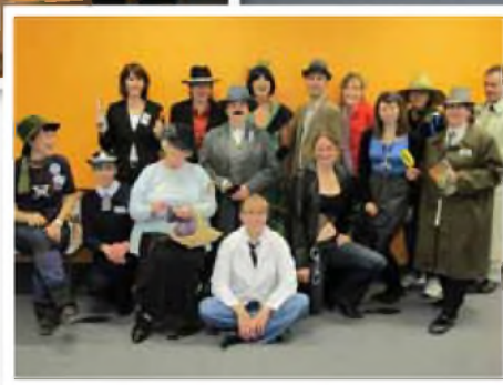
From Miss Marple to Phryne Fisher, Bendigo TAFE LIW 2011