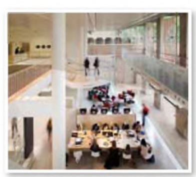
Sleek, sophisticated and accessible, the newlook Verandah at the State Library of NSW

A modern library is bright and welcoming. You can use your laptop while having a coffee, or talk to friends while reading newspapers. It's your living room in the city. But it's also a place for serious study, where you can pore over the books you requested online before you came in, or trawl through shipping lists on microfiche. Catering to this diversity was the