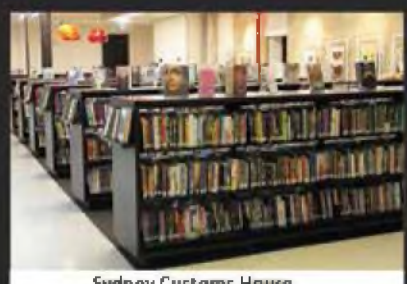
Sydney Customs House