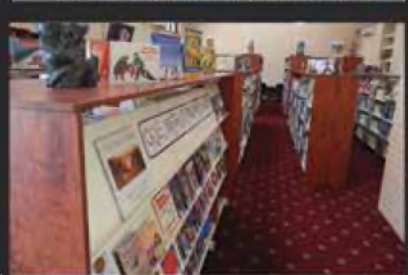
Redeemer Baptist College

50 years of Kingfsher " luxury systems in Australia proves the tert of rime; discover how Kinghaber" can create your library