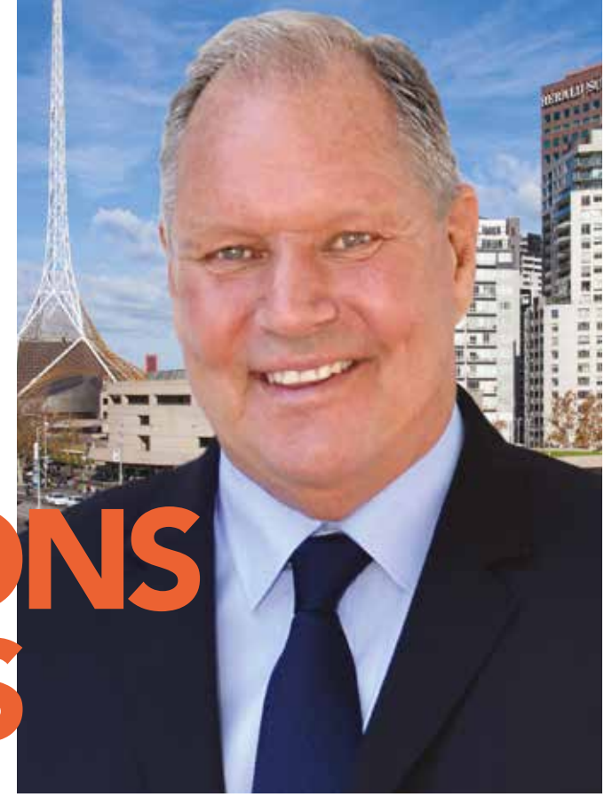
Melbourne Lord Mayor Robert Doyle

It's an expression of the character of the city. I was delighted to rename one of our laneways Literature Lane in